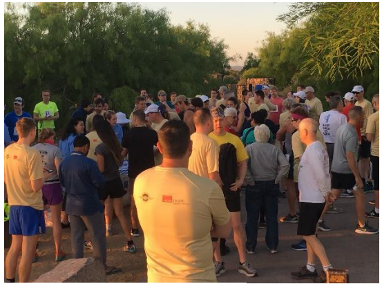
UTMB race support team and runners prepare for the Trumbo 5K Preventive Medicine Run/Walk Event